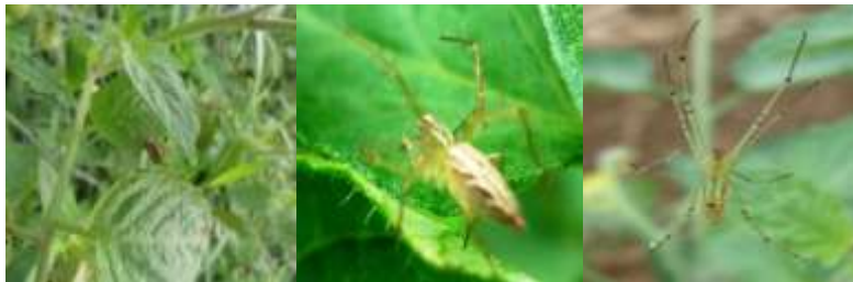
Figure 1.a. & b. The wolf spider, Lycosa sp. (Araneae) on tomato b. an unidentified web-spinning spider

Figure 1-5 are the insect pests that fed on various parts of tomatoes grown under MSU condition.