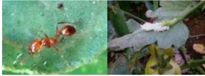
Figure 7. a. An ant b. Cocoons of parasitic wasp ( Braconidae ) on tomato fruitworm.