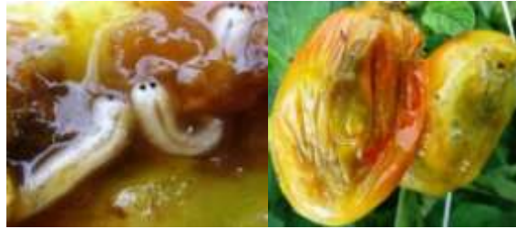
Figure 6 .a. The maggots of melon fruit fly, Bactrocera cucurbitae b. damaged fruits caused by the melon fruit fly