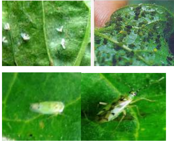
Figure 4. a. The melon aphids ( Aphis gossypii ) b. white fly, Bemisia tabaci c. tomato leafhopper ( Empoasca sp.) d. leaf bug, Physomerus grossipes