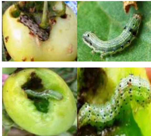
Figure 5.a& b. The common cutworm, Spodopteralitura . c& d. tomato fruitworm, Helicoverpaarmigera .