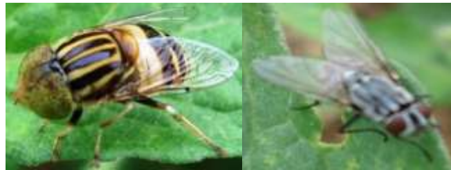
Figure 8.0 Muscid flies ( Muscidae ) found on tomato plants.

A number of house flies and muscid flies are seen in tomato agroecosystem. However, these flies are neutral insects. Adults of these insects can be predatory but they cannot do harm in the tomato plants. They can be behematophagous, saprophagous, or feed on a number of types of plant and animal exudates. They can be attracted to various substances including sugar, sweat, and blood. Larvae occur in various habitats including decaying vegetation. These insects do not cause any damage to tomato plants.