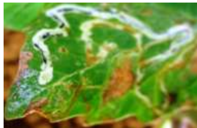
Figure 2. The serpentine tunnel made by the leafminer, Liriomyza sp.