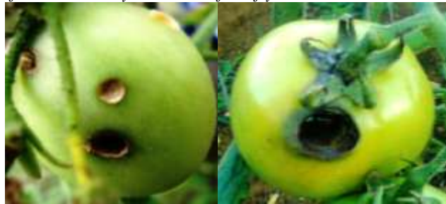
Figure 8. Damage caused by tomato fruit worm, Helicoverpa armigera