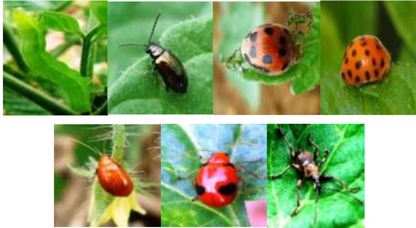
Figure 3.a. The cabbage looper, Trichoplusia ni b. flea beetle, Psylliodes sp. c. 12-spotted ladybird beetle, Epilachnachrysomelina d. 28-spotted ladybird beetle, Epilachnaphilippinensis e. squash beetle, Aulacophorapavonana f. an unidentified beetle g. curculionid beetle, Metapocyrtus sp.